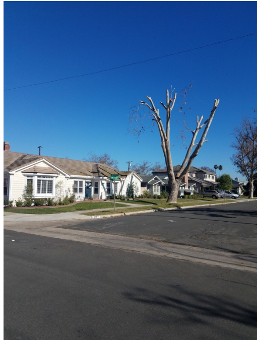
Above photo taken 12/3/18 at 11:50 a.m.