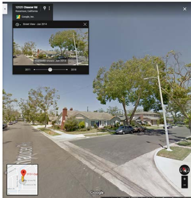
Google image capture July_2014