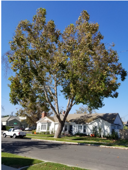
Above photo taken 10/24/18