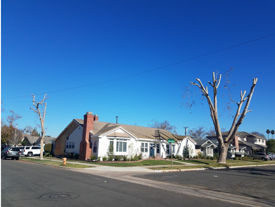
Above photo taken 12/3/18 at 11:50 a.m.