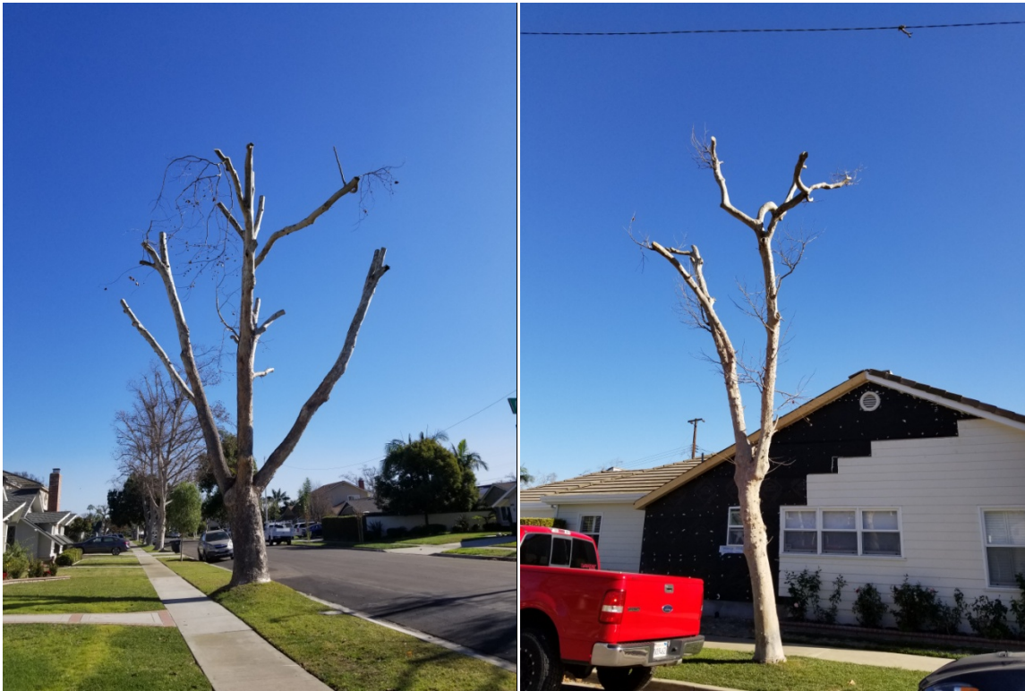
Above photos taken 12/28/18 at 11:40 a.m.